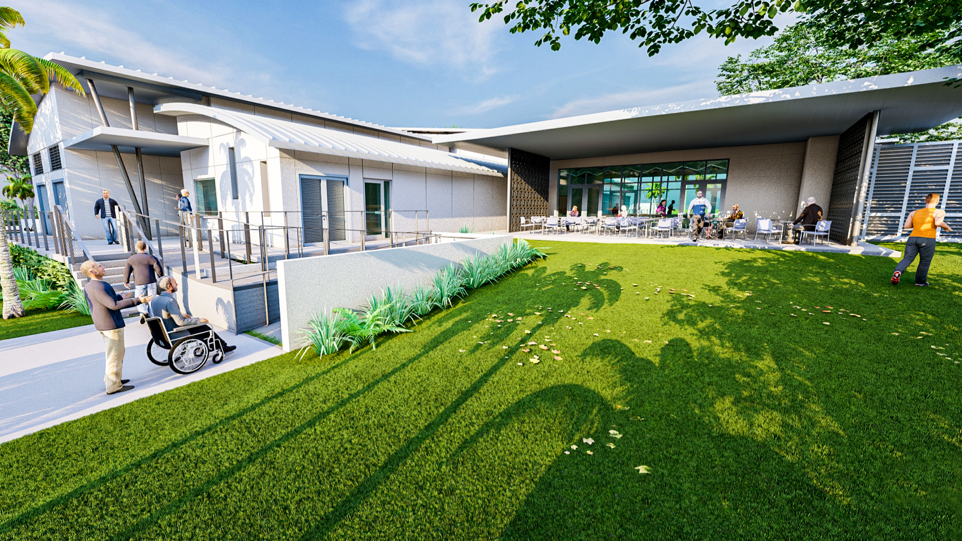
VIEW TO OUTDOOR PAVILION SOUTH VIEW