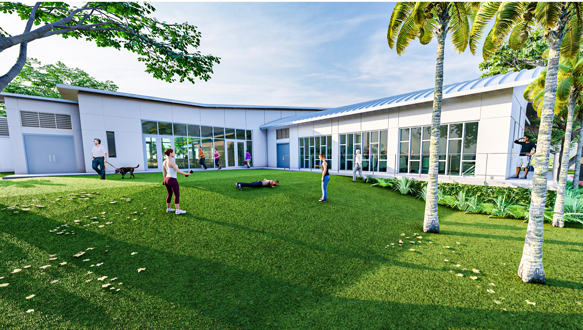
VIEW TO THE FITNEES CENTER & ASSEMBLY SPACE EAST VIEW