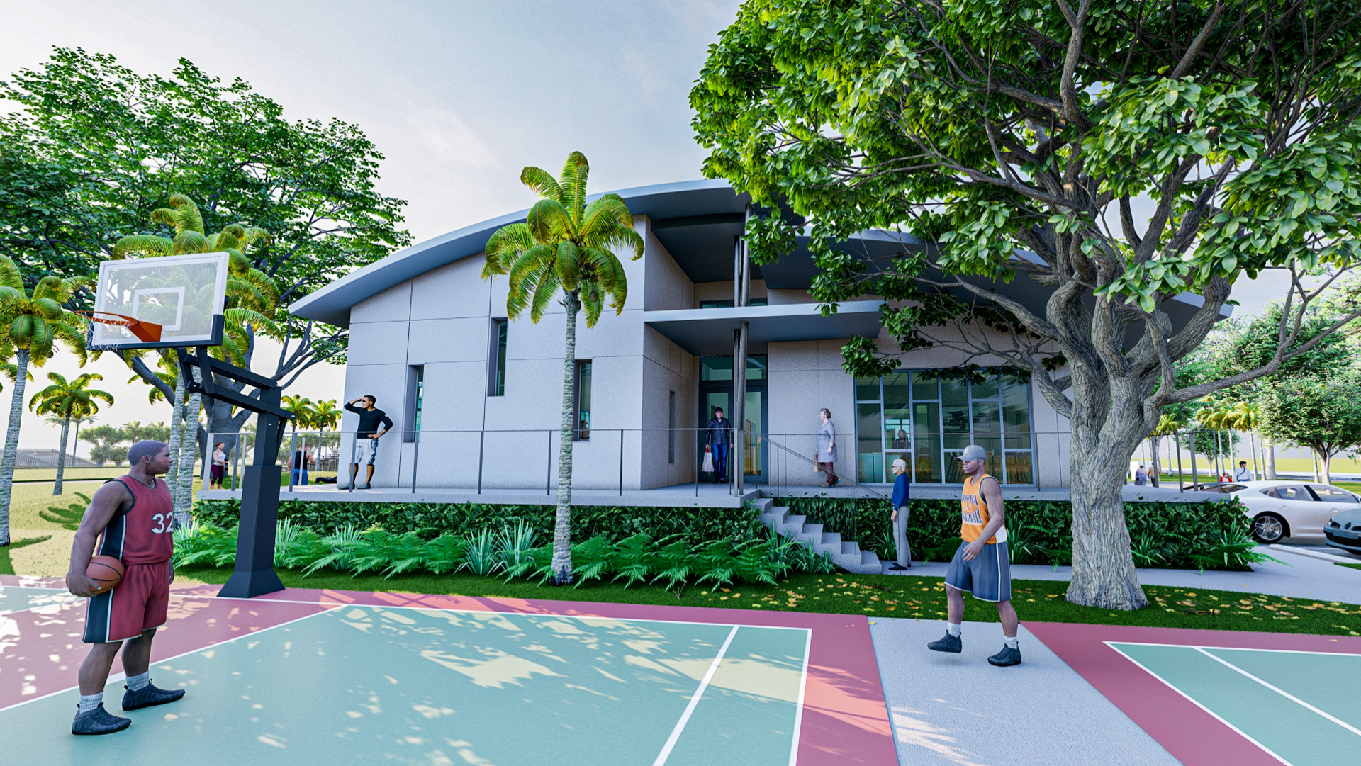
VIEW FROM THE BASKETBALL COURTS NORTH VIEW