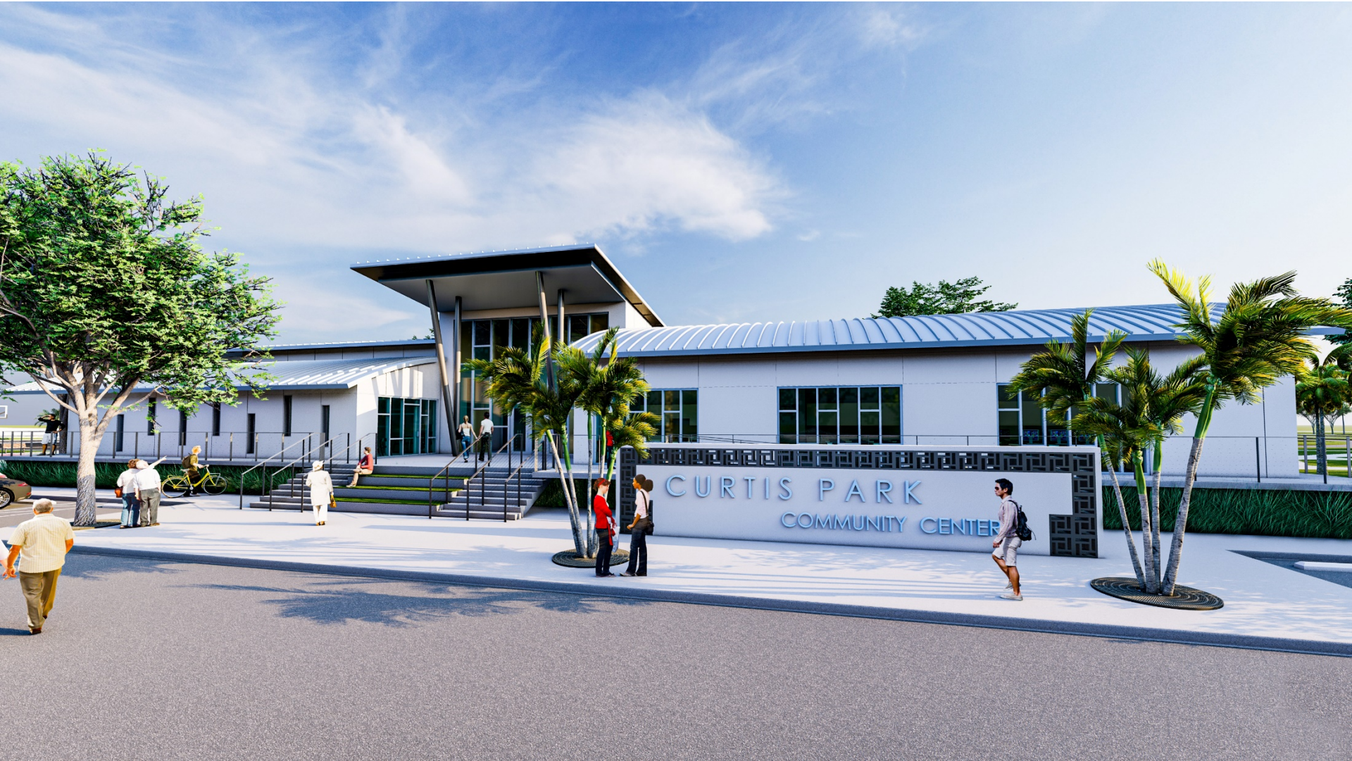
FRONT ENTRANCE WEST VIEW