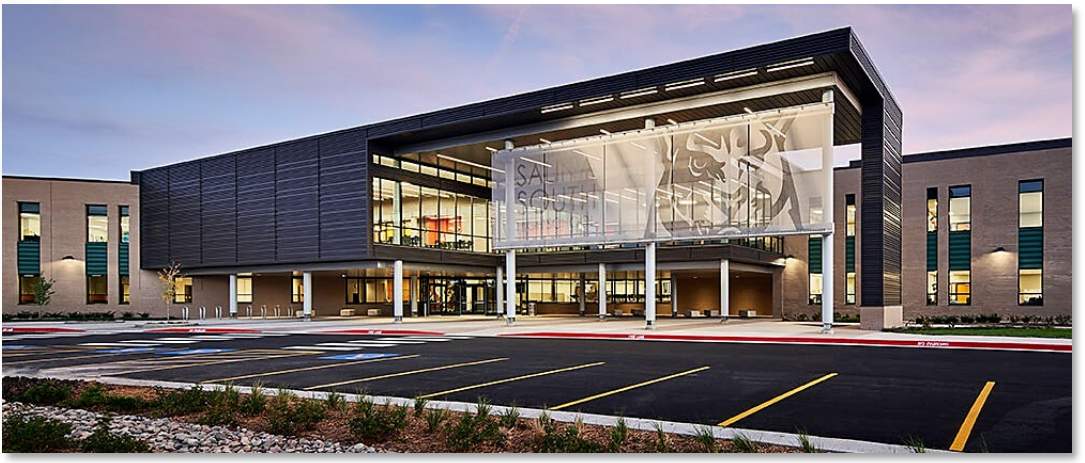
COMMUNITY CENTER SAMPLE CONCEPTS