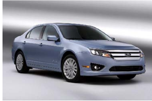
2010 FORD Fusion Hybrid