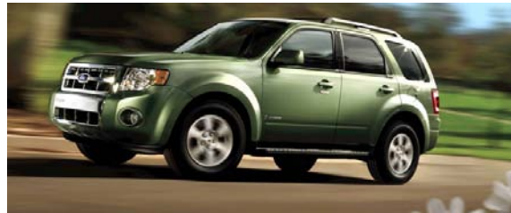
2009 FORD Escape Hybrid

Our event last month with Chevrolet was a big success and we are hoping for a repeat with FORD's Hybrid offerings. Other cars may also be added to the lineup and I will keep you up to date as soon as the additional cars are confirmed.