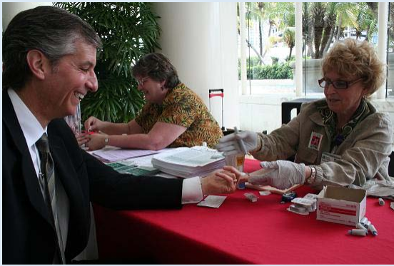
Getting screened for Diabetes at Diabetes Alert Day

Everyone should be aware of the risk factors for type 2 diabetes. People who are overweight, under active, and over the age of 45 should consider themselves at risk. The ADA urges everyone to take the Diabetes Risk Test.