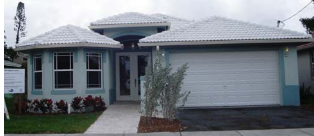
Above: A photo of the green home's façade.

Right: Landscaping helps conceal one of the home's two rainwater collection tanks. The home's gutters empty into the tanks and the water can later be used for gardening.