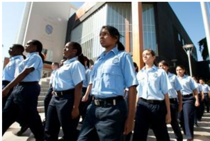
Students from the future Class of 2013 march down in front the steps of the new Police College and Law Enforcement Magnet High School. These students will be able to focus their studies in Law, Criminal Justice and Forensic Science.